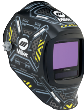
Black Ops™ 289715