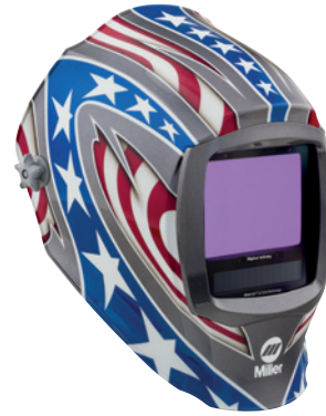
Stars and Stripes™ 288420